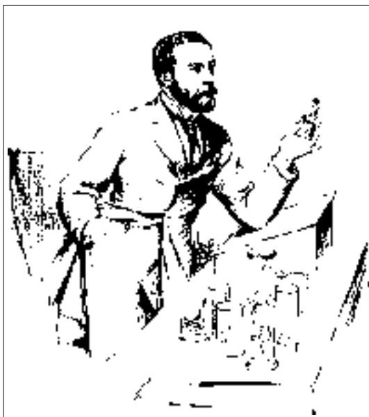
Pharmacologist Thomas Fraser collaborated with his University of Edinburgh colleague, chemist Alexander Crum Brown, on early studies of the relationship between chemical structure and pharmacological activity.

In their first experiments on the subject, they studied the pharmacological activity of six alkaloids, as well as their methylated derivatives. They found that upon methylation the ability of these alkaloids (e.g., strychnine) to produce convulsions disappeared. The narcotic properties of morphine and codeine were also diminished. At the same time, the methylated compounds exhibited a very different toxic effect, although gener-